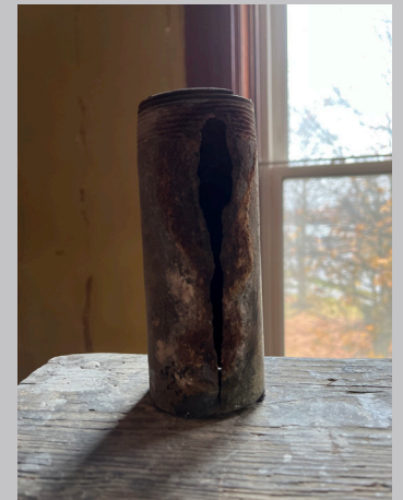
Pictured above are deteriorated pipes from an upstairs bathroom.